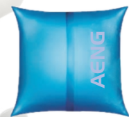
CSPP 500 ml